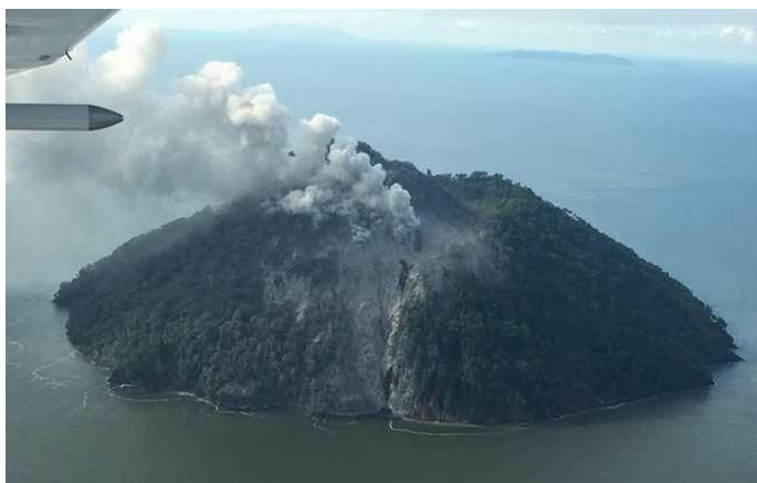
Volcanic activity in Kadova Island on 6 January 2018.

As of 6 January, prevailing wind conditions have carried ash clouds west of Kadovar island. Kadovar (Kadowar) is a small island belonging to the cluster of islands referred to as Schouten Islands. Kadovar is approximately 100km from Wewak (line of sight) and 24km to nearest point on mainland East Sepik province. Kadovar is part of Wewak Island Rural LLG in Wewak District, East Sepik Province. 2