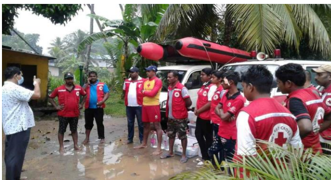
Sri Lanka Red Cross Society (SLRCS) branch volunteers receive guidance on their response activities.

The southwest monsoon weather conditions have caused rainfalls since 19 May 2018 in the southwest parts of the island. By 21 May, the precipitation triggered a flood and landslide situation in the country, which has affected thousands of lives and livelihoods, as well as caused property damage. According to the situation update by the Disaster Management Centre (DMC) of Sri Lanka, as of 1200 hours of 26 May 2018, a total of 153,712 1 people in 19 districts have been affected and 20 people have died due heavy rains, strong winds, lightening and landslides. People in flood-risk areas have been evacuated to safe locations. Approximately 14,437 families have been evacuated into 265 welfare centres in ten districts. Puttalam, Kegalle, Kalutara, Ratnapura, Gampaha and Colombo are amongst the worst affected districts.