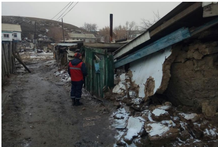
Image 2. Kazakh Red Crescent responding to the emergency caused by floods.

Kazakh Red Crescent has provided evacuees with water, food, warm clothes and blankets and psychosocial support. KRC provided assistance to vulnerable groups of citizens whose houses had been completely destroyed or affected by floods in the city of Ayagoz. The victims were given assistance bank cards to which monetary assistance was transferred. In the first round, on 16 March, 158 people from the most vulnerable categories of citizens received assistance. In the second round, on 19 March, 410 people received assistance, representing the following vulnerability categories: pensioners living alone, single mothers, large families with low income, and disabled people. These funds will help people survive the first and most difficult days of the crisis and meet their primary needs – including in food, sanitary and hygiene and kitchen accessories, bedding, medicine, and clothing. 122 families (568 people) have received help altogether, with a total of KZT 17,040,000 (appx. CHF 50,400).