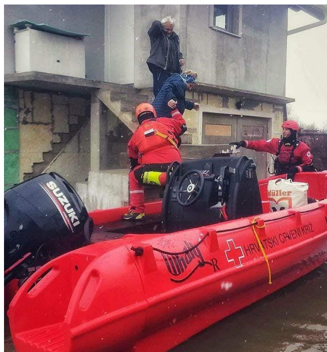
Image 1. Croatian Red Cross rescue team evacuating residents from a home affected by heavy flooding.

The situation worsened on 19 March, affecting even the suburban areas of the city of Shkodra, where 25 people were evacuated by military and police, and accommodated in a high school dormitory. The deterioration of the situation was caused by the discharges of HPPs Fierzë, Koman and Vau Deja, as well as the high amount of precipitation in Shkodra area, particularly in its northeast. Authorities increased the amount of compulsory discharges in order to reduce pressure on dams, as water levels are at an almost critical level. The villages of Velipoja