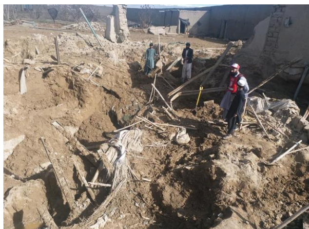
Disaster Response Teams are conducting rapid need assessment in flood affected areas of Afghanistan.

Afghanistan is highly prone to intense and recurring natural hazards such as flooding, earthquakes, snow avalanches, landslides and droughts due to its geographical location and years of environmental degradation. Climate change also poses a threat to Afghanistan's natural resources, of which the majority of Afghans depend for their livelihoods. Afghanistan faces significant impacts of climate change and disasters which impact growth prospects. It has a continental climate, which combined with its location at the western end of the Himalayas, renders it susceptible to extremes of temperature and rainfall. Together with the limited vegetation in many mountainous areas, extensive destruction of forests and warmer temperatures limiting snowfall, spring and summer storms in particular can lead to flash floods in many parts of the country.