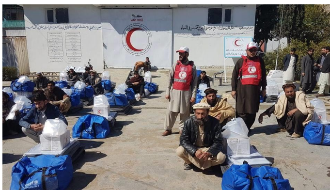
ARCS is distributing NFIs to the flood affected families.

deteriorating situation for the last three weeks. ARCS National Headquarters requesting its provincial branches to submit primary information reports regarding flooding situation in their respective provinces. The EOC at headquarters level has been activated to coordinate with relevant stakeholders and update on the situation on a regular basis. ARCS provincial branches mobilized its branch trained staff and volunteers to conduct rapid assessment in flood affected provinces with the support of National Headquarters' technical capacity.