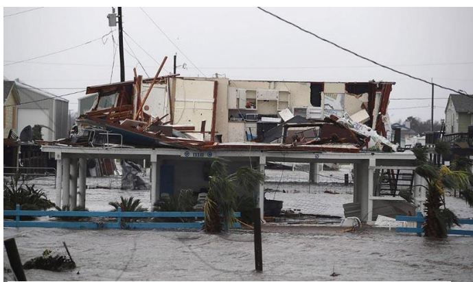
A severely damaged home in Rockport, TX.