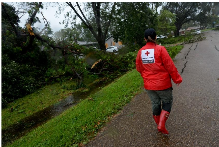
An AMCROSS volunteer conducts a damage assessment in a stricken neighbourhood.