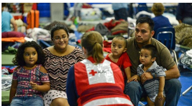
A AMCROSS volunteer speaks with an affected family.