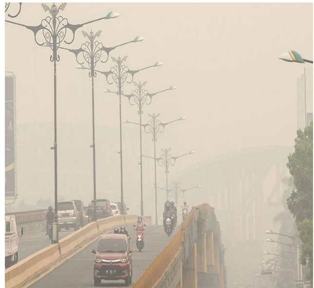
Haze and air condition in Riau.

seven water bombing helicopters operating in the area with additional one patrol helicopter responding to the fire. Approximately 127 million liters of water have been dropped on to the hotspots.