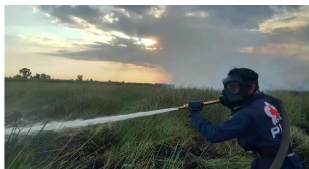
PMI volunteers responding to the situation.

The air condition in West Kalimantan has started to get dusty and the thick smog has reduced visibility. It has been reported that there's a decreasing quality of clean water in ways that it started to taste salty. In addition, people have suffered from Respiratory Tract Infection