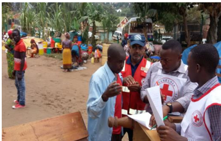
TRCS Kagera Branch volunteers doing an initial assessment of the impact of the earthquake in Bukoba, Kagera region.

Since the onset of the disaster, the Tanzanian Red Cross Society (TRCS) and the government have been responding to the situation. The TRCS Kagera branch collaborated with the Kagera regional and Bukoba district authorities in emergency search and rescue and dead body management. They also provided emergency first aid and medical services to the injured persons, with referrals to the regional hospital which was overwhelmed by the situation.