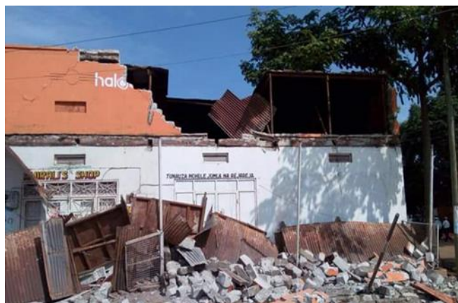
A collapsed building in Bukoba town, following the earthquake.