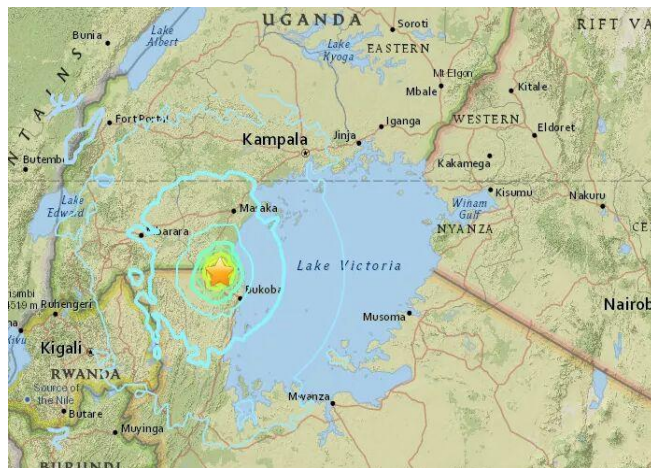
Earthquake affected area of Bukoba, northwest Tanzania

Immediate needs of the affected population include emergency shelter, medical supplies, non-food relief items, food and psycho-social support. The TRCS local branch also needs support in terms of logistics for assessments, non-food relief distributions, vehicles for transport and communications.