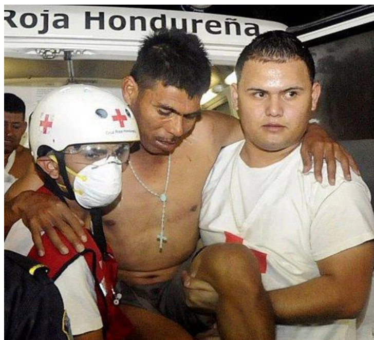
Some 30 volunteers of the Honduran Red Cross (HRC) were activated during the night on 14 February to assist hundreds of inmates at Comayagua Penitentiary.

During the night on 14 February, a fire spread in the Comayagua Penitentiary (Granja Penal de Comayagua) affecting several sectors of the centre. Although figures need to be confirmed, official statements report that 356 inmates have lost their lives and many more are injured.