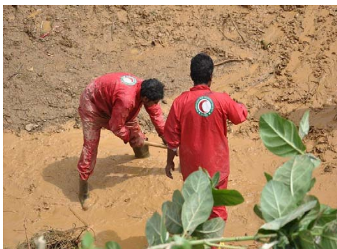
Bangladesh Red Crescent Society (BDRCS) volunteers in search and rescue operation in Chittagong mud slide on 27 June 2012.

This bulletin is being issued for information only, and reflects the current situation and details available at this time. The Bangladesh Red Crescent Society (BDRCS), with the support of the International Federation of Red Cross and Red Crescent Societies (IFRC), has determined funding from its internal sources to mobilize emergency response to the affected areas. No external assistance has been requested at this time.