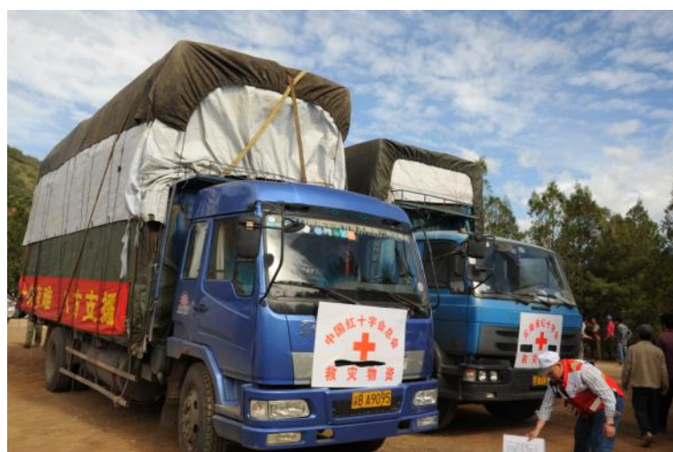
RCSC national headquarters sent relief supplies to Sichuan province.

In the past months, in addition to the response to flooding throughout many regions in the country, the RCSC had responded to two earthquakes disaster a magnitude 5.7 earthquake in Yunnan province and a magnitude 6.6 earthquake in Xinjiang Uygur Autonomous Region. An assessment team was dispatched on June 24 to Yunnan, while 6,000 quilts, 2,000 family kits, 500 tents and CNY 100,000 (CHF 15,511) emergency funds were sent out to the two quake-hit areas.