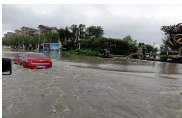
Affected area in Sichuan province.

Torrential rains and floods continued to hit southern and northern China since the end of April. At least 147 counties in 22 provinces across the country were affected by floods, landslides and mudslides. According to a statement from the government, up to mid-May, due to continuous rains and floods at least 102 people have died, 30 missing, 13,119,000 affected, and 318,000 relocated. A total of 143,000 houses collapsed or were severely destroyed, while 949,400 hectares of farmland were damaged. Total direct economic losses had reached CHY 16,880 million 1 (approximately CHF 2.6 million).