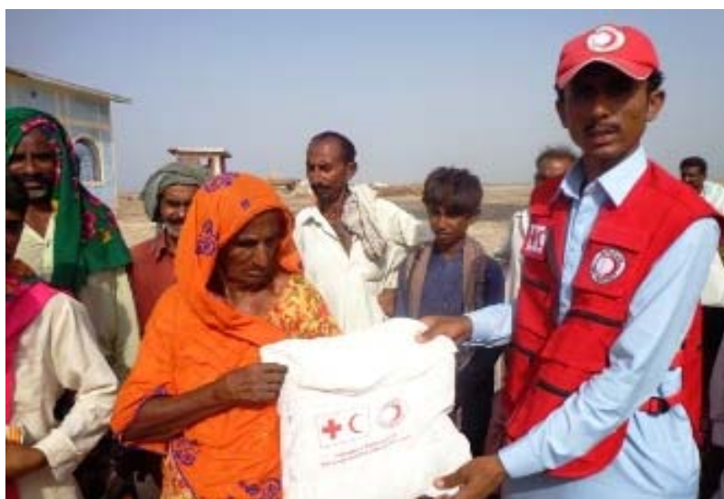
Relief distributions in Sindh Province.

The IFRC country office is supporting the PRCS floods response activities which are aimed at assisting 7,500 families (approximately 52,500 people). Support is being drawn from resources available in-country and possible support from partners who may wish to contribute to the PRCS response activities is being facilitated.