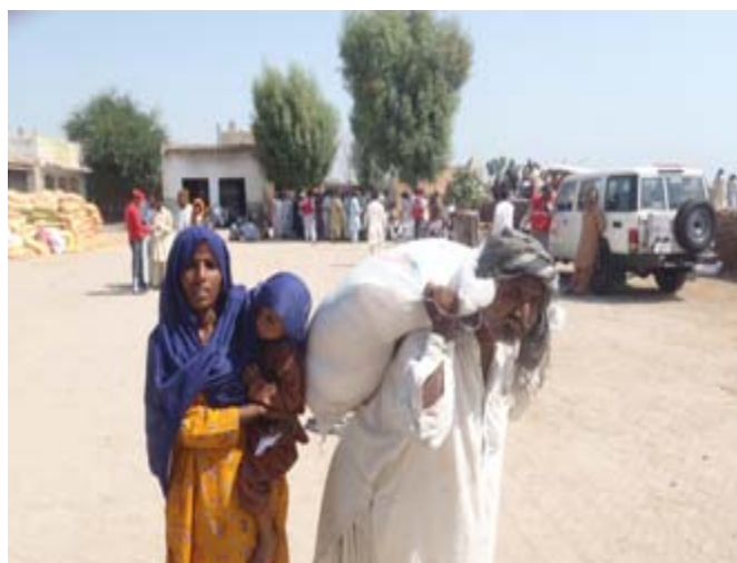
Beneficiaries receiving a food pack in Shikapur district at the relief distribution point in Sindh province.

The Government of Pakistan has pledged USD91 million to the monsoon floods response to date and has not requested for international assistance. Humanitarian partners are distributing food, shelter, health and water, hygiene and sanitation items from existing stocks to support the government's humanitarian assistance to people affected by floods in Balochistan, Punjab and Sindh provinces.