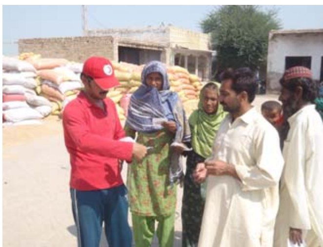
Beneficiary verification at the relief distribution point in Shikapur district, Sindh Province.

<click here for detailed contact information>