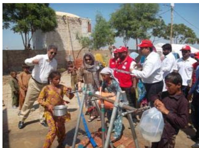
Children collecting drinking water from taps at PRCS water plant in Jacobabad, Sindh Province.