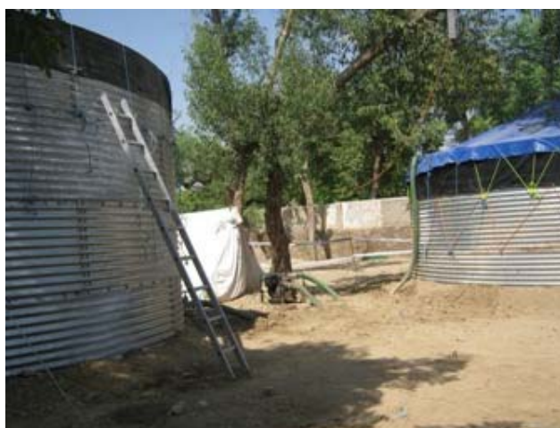
PRCS water treatment unit installed in Dera Ghazi Khan district, Punjab Province.