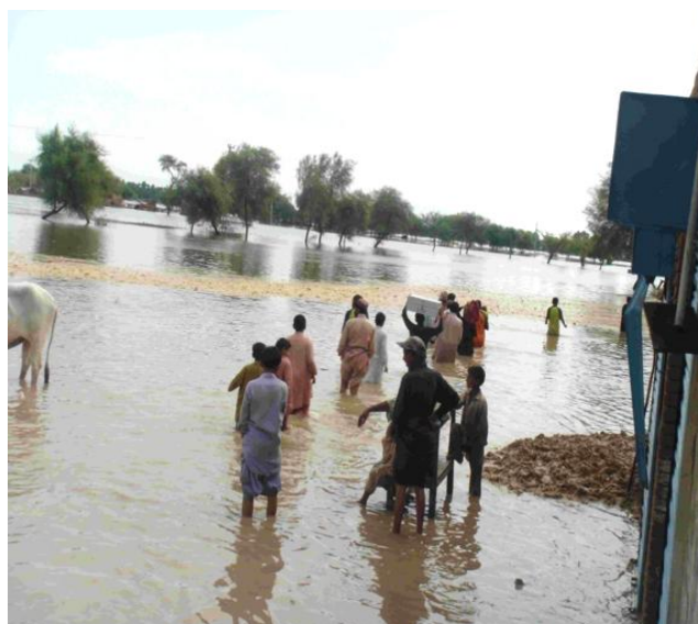
People affected by the flood waters in Balochistan.

While this year's monsoon rains came late with total rainfall levels below normal, an intense burst led to the flooding causing significant damage and casualties in the affected areas. Infrastructural damages have also been evidenced including transport links such as roads and bridges. Further, the rains have washed away tens of thousands of acres of crops along with livestock and poultry in some areas. To date, it is recorded that 370 people have lost their lives while 1,197 people have been injured. The damages and losses recorded thus far based on National Disaster Management Agency (NDMA) figures are detailed in table 1.