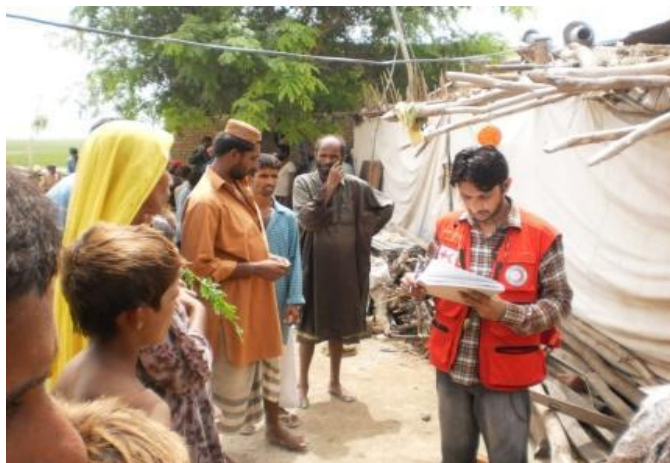
Beneficiary registration in Punjab.

NDMA, the Provincial Disaster Management Agency (PDMA) and local district authorities are providing humanitarian assistance to the flood affected people, including tents, blankets and food in Punjab, Sindh and Balochistan provinces. The UN and other humanitarian partners plan to distribute food, shelter, health and water, hygiene and sanitation items to support the government's humanitarian assistance to people affected by the floods in seven of the most-affected districts: Jaffarabad and Naseerabad in Balochistan province; Dera Ghazi Khan and Rajanpur in Punjab province; Jacobabad, Kashmore and Shikarpur in Sindh province. 3