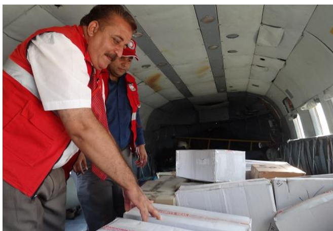
PRCS staff mobilizing medicines to the affected area via helicopter.

PRCS has NFIs from its disaster preparedness (DP) stock in country on standby to assist approximately 30,000 families. PRCS warehouses located in Karachi of Sindh province and Quetta of Balochistan can provide NFI stocks for approx. 9,000 families and 4,700 families, respectively. Quetta of Balochistan province takes approximately 20 hours road travel to cover the 654 kms to Awaran, whilst it takes about eight hours to travel the 323 kms from Karachi of Sindh province. Six of the 37 Disaster Management (DM) Cells established to respond to emergencies are located in Balochistan province, with both Lasbella DM Cell and Gawadar DM Cell able to provide NFI stocks for 200 families. All these prepositioned stocks are available for rapid distribution by PRCS once immediate needs are confirmed.