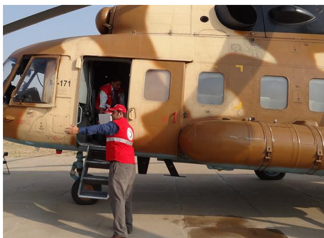
PRCS Team loading medicines in the helicopter for Awaran. A Health team consisting of two doctors and two paramedics has been heli-dropped with medicines in Awaran City.

The Provincial Disaster Management Authority (PDMA) of Balochistan on 26 September at 11:31hr PST has reported 355 people dead and another 619 people injured (from Awaran and Kech districts). 3 Although the extent of the damages and losses are yet to be confirmed, the latest information indicates that approximately 21,000 houses (mostly of mud-brick construction) have been damaged, and 300,000 people affected. In