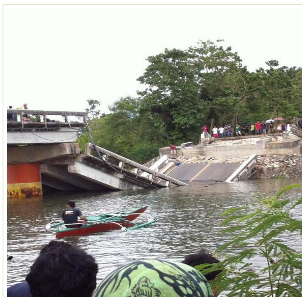
Following the earthquake, municipalities in Bohol have been isolated after bridges collapsed and roads were rendered impassable due to landslides or physical damage.

Following the magnitude 7.2 earthquake that struck Bohol and Cebu islands in Central Visayas on the morning of 15 October, the number of deaths is now 171 according to the latest the National Disaster Risk Reduction and Management Council (NDRRMC) update. However, the death toll may rise as responders reach some of the hardest hit towns which were isolated. The NDRRMC update also indicates that 375 people have been injured and 20 missing.