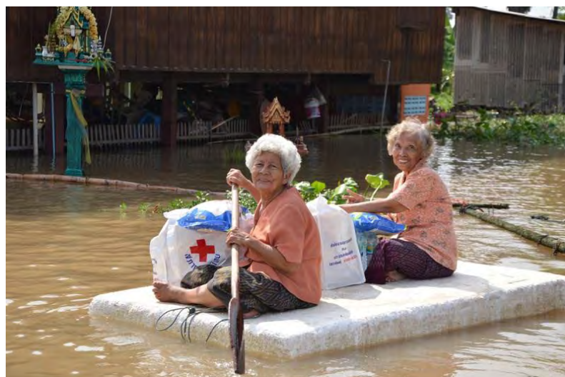
Beneficiaries of Thai Red Cross relief kits in Phatum Thani Province.

In Prachinburi and Chachengsao located in central Thailand, the flood situation is still very critical, despite water levels dropping about 10 cm per day