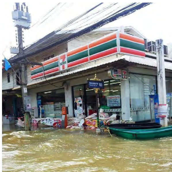
Prachin Buri province in central Thailand is among the provinces worst affected by this year's flood.

It is forecast that from 16-22 October, the remnants of Tropical Storm Nari will continue to bring heavy rain over the lower northeast, lower north, east and central provinces of the country, including the Bangkok metropolitan area and its surroundings.