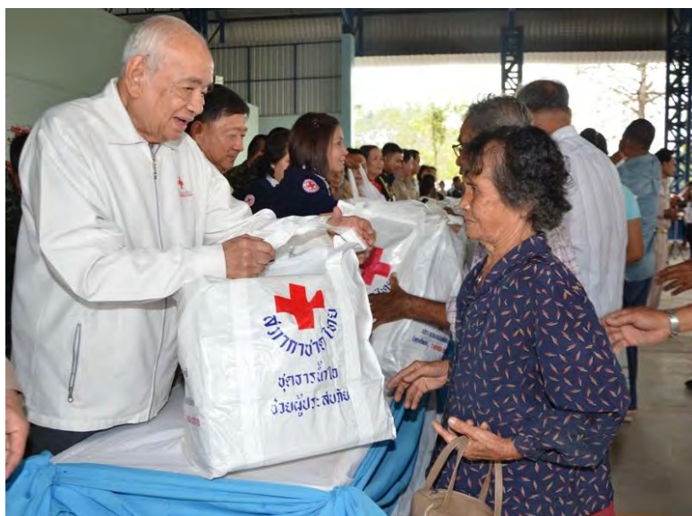
The secretary general of Thai Red Cross, together with staff and volunteers, distributes family kits to those most affected by these floods in Chacheungsao Province.

Thai Red Cross is not seeking international assistance at this time; currently, there are no plans for either a disaster relief emergency fund (DREF) allocation or an emergency appeal. The National Society has utilized contributions from the Japanese Red Cross Society that supported procurement of