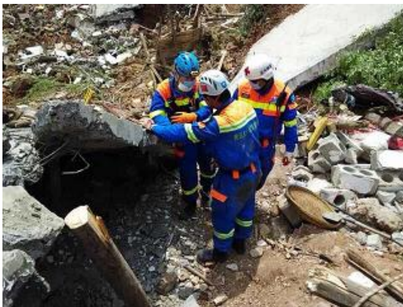
The Blue Sky Search and Rescue ERT deployed to the affected area to rescue operation.

According to the statistics by the Yunnan Provincial Civil Affairs Bureau, as of 09:20 am on 8 August, a total of 1.09 million people were affected and 229,700 people were displaced in Yunnan Province. More than 615 people were confirmed and 3,143 injured, and 25,800 houses collapsed and 40,600 houses were severely damaged. Besides Yunnan Province, minor impacts have spread to part of Guizhou and Sichuan Provinces, affected a total of 27,100 people. 1