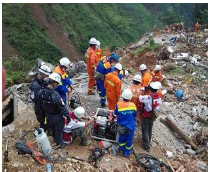
The Blue Sky Search and Rescue ERT deployed to the affected area to rescue operation.

To date, RCSC Headquarters, Foundation and local branches (Hong Kong, Macau and Taiwan Red Cross) have received CNY 25.56 million (approx. CHF 3.7 million) worth of relief items. Some relief items are being transported to the affected areas since the onset of the earthquake. These include tents, quilts, family kits, summer sleeping mats, blankets, hygiene kits, rice, instant noodles, and bottled waters.