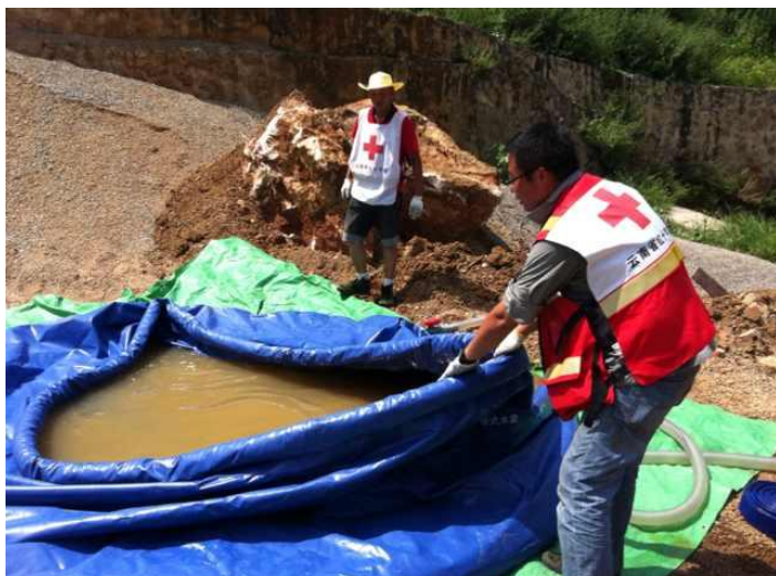
Water and Mass Sanitation ERT from Yunnan Red Cross is setting up water equipment in affected area.