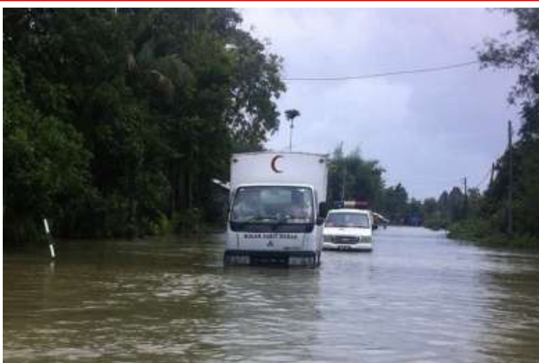
MRCS truck delivering relief supplies braved through the floods water to reach the evacuation centres.

Electricity supply was suspended and water sources were affected. The majority of houses and buildings were submerged by the flood waters in the three states.