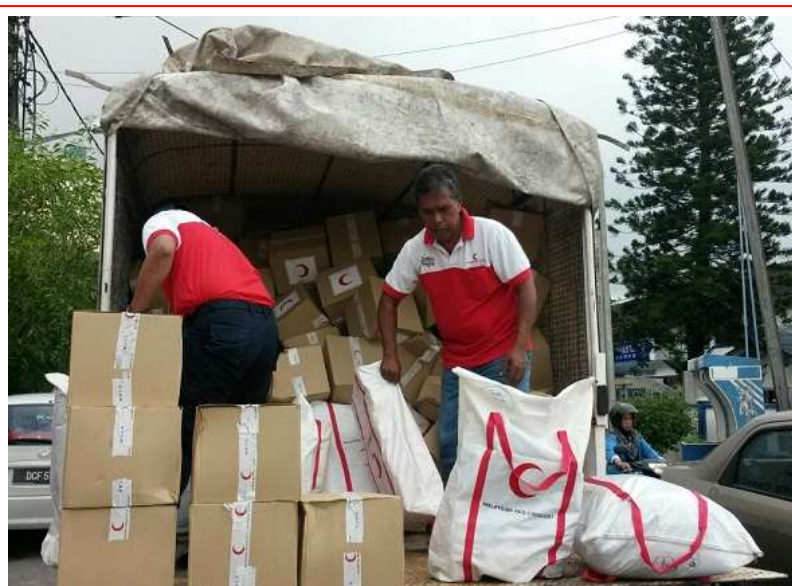
MRCS staff and volunteers unloading relief supplies at one of the evacuation centres.

The International Federation of Red Cross and Red Crescent Societies (IFRC) Asia Pacific zone office continues to support MRCS as required.