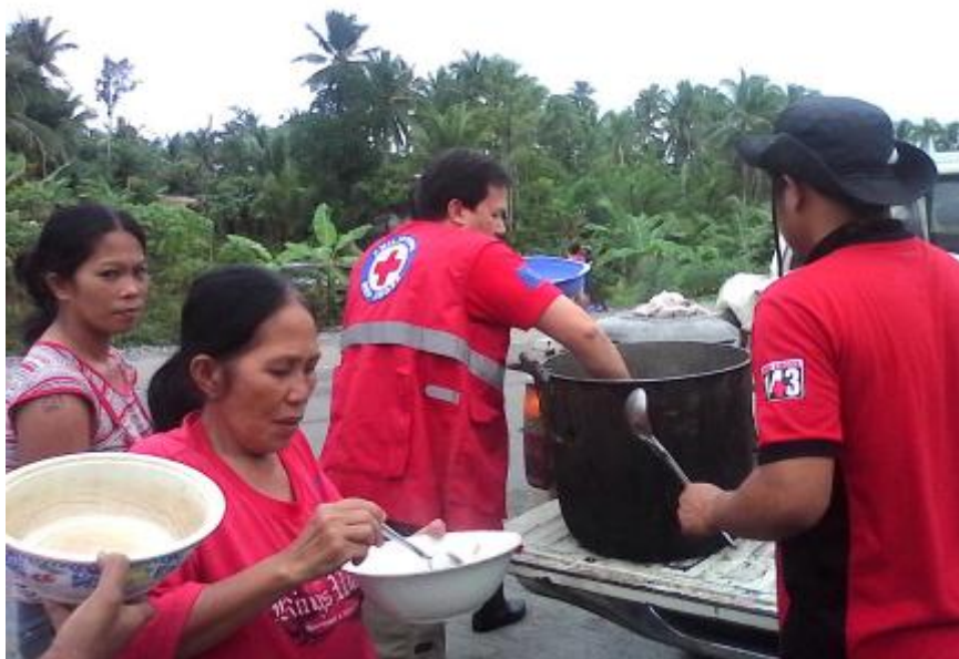
Staff and volunteers of the Philippine Red Cross serve hot, ready-to-eat meals to some of the people affected by floods in the province of Compostela Valley.

The incessant rains left thousands of travelers stranded after sea vessels and flights were cancelled due to bad weather. Even though the intensity of the rains has since eased, access to some areas remains a challenge; a total of 50 roads and 25 bridges are still not passable. Delivery of relief in the municipalities of Cateel, Boston and Baganga in Davao Oriental is constrained because three major bridges have been damaged. It is worth noting that the hardest hit provinces of Agusan Del Sur, Compostela Valley, Davao Oriental and Surigao Del Sur are still recovering from the effects of Typhoon Bopha that struck in December 2012.