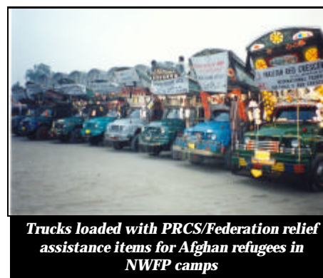
Trucks loaded with PRCS/Federation relief assistance items for Afghan refugees in NWFP camps

In addition, the Federation arranged for local procurement of 2,000 kerosene lamps, which were distributed among the refugee population in Bagzai camp, NWFP. Also, 12,000 blankets and 1,000 tents from the PRCS stock were distributed to refugees in Landi Karez, Killi Faizo, Dara and Mohhamed Kheil camps in Baluchistan province. These items will need to be purchased to replenish the National Society disaster preparedness stock.