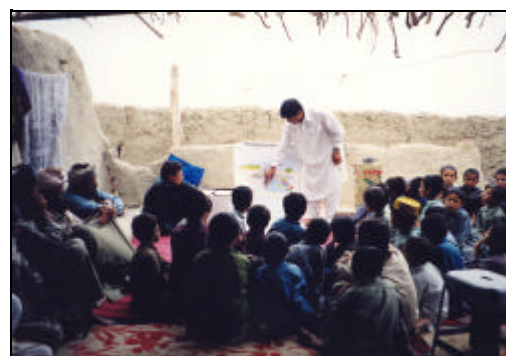
PRCS health motivator teaches villagers about the importance of nutrition, hand washing or how to treat diarrhoea and respiratory tract infections

PRCS and the Federation were also able to provide immediate response to the emerged needs of relocated refugees through supporting them with basic relief items in close coordination with UNHCR and Commissionerate for Afghan Refugees (CAR). More than 80,000 refugees including Tajiks, Uzbeks, Hazaras and Pastuns, were moved to the three new camps in the tribal areas of Kurram, Bajaur and Kyber Agencies as the Jalozai refugee camp near Peshawar was closed down by the Provincial authorities. The refugees were accommodated as follows: approximately 2,000 families were sheltered in Old Baghzai camp; another 2,000 were accommodated in Ashgaro camp, while 240 families were transferred to Bazu camps. Around 3,500 families were moved to Kotkai camp, in Bajaur agency. The camp here is already over-crowded. Therefore, UNHCR has opened another camp near Barkley. A group of 180 refugees families has been shifted there. In Kyber Agency, the refugees were reallocated among the two existing camps, 2,200 families were moved to Shalman 1 camp, while another 725 families were accommodated in the newly established camp Shalman 2 . The transportation of these refugees was arranged by UNHCR and CAR.