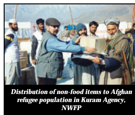
Distribution of non-food items to Afghan refugee population in Kurram Agency, NWFP

The sufficient quantity of relief items (a total of 14 trucks: 12 trucks for Ashgharo and two trucks for Basu) had been pre-positioned initially at the UNHCR/CAR Rub Hall in Ashgharo in order to ensure efficient delivery of the non-food aid to the beneficiaries. Transportation of the commodities to distribution points was ensured by the National Society. The distribution was implemented subsequent to a detailed needs assessment carried out by the Federation/PRCS in these target camps to identify the most vulnerable people, and was conducted from central distribution points established in each camp. The National Society had mobilised its volunteers to undertake the on-site distributions. The overall coordination of the operation was ensured by the Federation delegate and PRCS relief co-ordinator. Federation representatives were present at all distribution points to ensure the competence of the distribution management and to ensure the intended beneficiaries received the assistance.