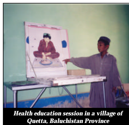
Health education session in a village of Quetta, Baluchistan Province

Although the health messages are basic, most of the information shared with the beneficiaries are new to them. Involving the locals by enlisting them as PRCS volunteers has been an effective tool. Over 300 volunteers of all ages, 57% of them female, have been recruited and received training, so far, in order to assist in the process of further dissemination of health messages including how to administer treatment for fractures, burns and shocks, as well as to provide basic first aid to their respective communities.