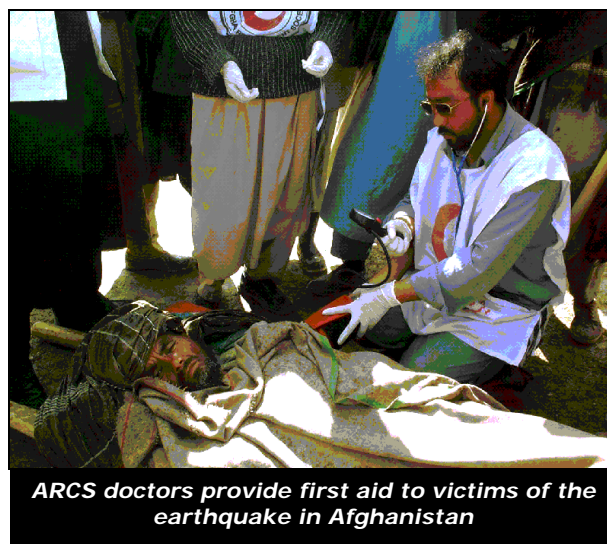
ARCS doctors provide first aid to victims of the earthquake in Afghanistan

The present set up of the DP Project in Afghanistan is in the process of being revised, exploring possibilities to cover more specific regional needs and conditions. The reoccurrence of natural disasters in the country, ranging from earthquake prone areas (northern- and central regions, including Hindukush) to areas more prone to floods (north-west and southern regions). By adjusting the composition and quantity of DP stocks to prevailing disasters and the population density, the Federation and ARCS will respond to natural disasters in a more efficient and tailored manner.