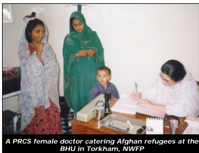
A PRCS female doctor catering Afghan refugees at the BHU in Torkham, NWFP

The NWFP Branch is now fully ready to proceed with a mobile health unit (MHU) in the Peshawar area. The health team has been recruited and all supplies and materials are procured. The services of the unit will be split between two locations - Haji Camp, on the outskirts of Peshawar towards the direction of Islamabad, and Board Area, also on the outskirts of Peshawar in the direction of the Khyber Pass and the border. It is anticipated that the MHU will become operational in the next week.