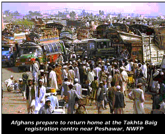
Afghans prepare to return home at the Takhta Baig registration centre near Peshawar, NWFP

A key refugee repatriation agreement was signed between the governments of Iran , Afghanistan and UNHCR on 3 April 2002 and was hailed by all three signatories as a highly significant marker in the process of helping Afghanistan to get back on its feet. The tripartite agreement, signed in Geneva, sets the main legal and operational framework for the voluntary return of Afghan refugees in Iran. The organised repatriation from Iran is planned to start in April. A total of 11 voluntary repatriation centres are being established across the country. UNHCR will bear transportation costs up to the two main border crossings into Afghanistan. Each returnee will also be given USD 10 and an assistance package including food, and basic tools. Under the agreement, the Afghan authorities have agreed not to discriminate against returnees and to facilitate the recovery of lost land or property. They will also recognise the legal status of refugees and allow spouses and children of Afghan refugees who are not themselves