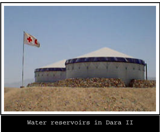
Water reservoirs in Dara II