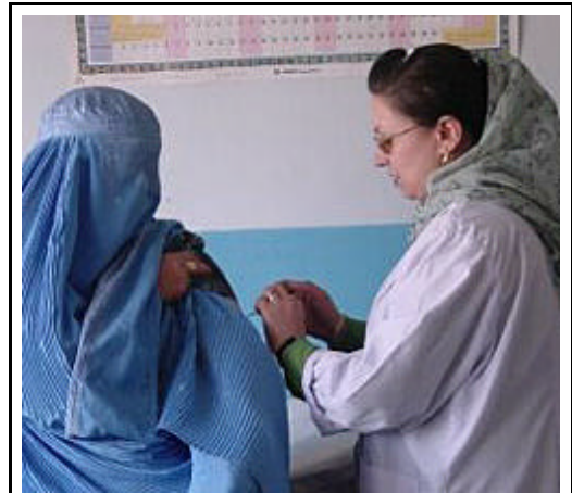
Tetanus injection at the ARCS clinic

Remaining challenges: Mothers and children are still dying on a daily basis from preventable illness. Grassroots interventions are the most effective way to lessen risk and the Red Crescent is championing this approach.