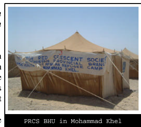
PRCS BHU in Mohammad Khel