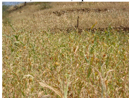
Dry and dying sorghum field, in Keren sub-zoba, not matured, September 2003.

Regarding the food security situation in the country, the low and late emergency response between January and August 2003 have caused an unstable availability of food items. Out of the 476,000 MT of food aid required, approximately 266,000 MT have been committed and some 160,000 MT (60%) of the pledges have been delivered. As a result, the response to the vulnerable people in the affected districts has been inadequate.