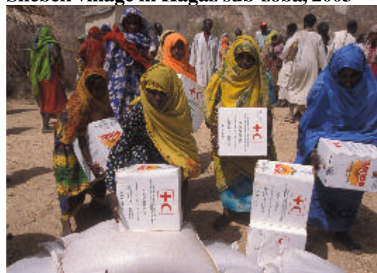
Shebek village in Hagaz sub-zoba, 2003

Graph 1 shows increase in wasting (thinness due to acute food shortage) among children below the age of five years; this graph can be seen at the end of this document. The biggest deterioration in the nutritional status of children is seen in Gash Barka region. The studies in Debub region have also shown that malnutrition has reached emergency level of above 10% while the levels of acute malnutrition in Anseba, Northern Red Sea, SRS and Gash Barka regions have gone above 15%. The implication of the high level of malnutrition is impaired early childhood development.