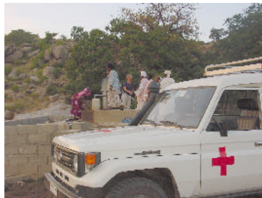
New well with hand pump by Red Cross in Balwa village, Keren sub-zoba, September 2003

Objective 1: To reduce water stress by provision of safe water supply through water trucking.