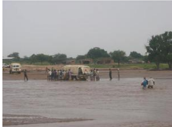
TSP vehicle transporting equipment from Abéché to Tréjine camp.

Four Land Cruisers are presently used in the camp operation. The use of the TSP in the preparation of the Tréjine camp has been agreed with the UNHCR. Once the camp is established, the TSP vehicles will return to their base in Iriba.