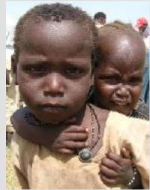
The situation in eastern Chad remains precarious.

This provisional extension of two months is based on the partnership meeting held 18 November in Geneva. An assessment team will be deployed in December and will develop detailed options; the next Operations Update will detail the team's recommendations. An extended timeframe until end-December 2005 is probable, including consideration of a revised budget if necessary.