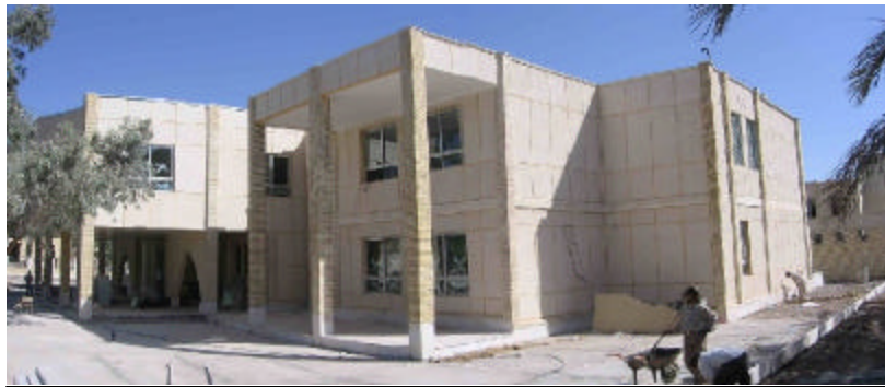
Farhangian primary school is one of the five standard schools that has reached its final stage of completion and will be at the disposal of students in September, 2006

In a meeting with the managing director of the contractor, Sanati Fajr Industrial Company, on the 16 th of August 2006, the Federation Delegation made it clear that the construction progress made so far was unsatisfactory and ran counter to the terms and conditions of the contracts signed by the two sides. The general contractor was warned that the Federation would apply a penalty to the company for the delays caused by the company's failure to implement the contractual obligations. A formal written warning letter was sent to the company on the 19 th of August, 2006.