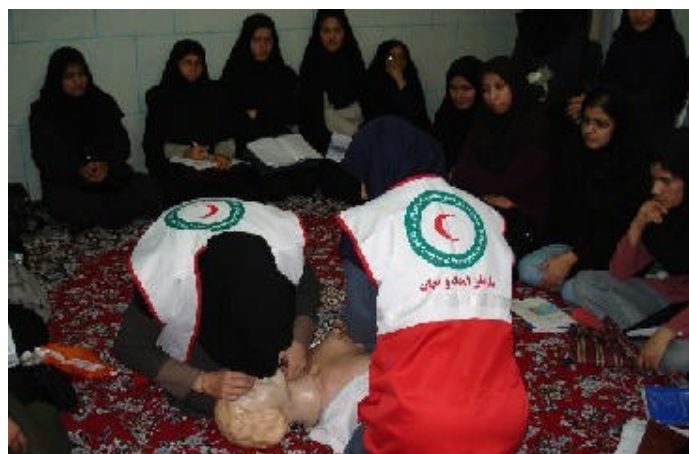
CBDP workshops cover various topics, ranging from disaster preparedness to first aid

Objective: The IRCS capacity in disaster management has been strengthened at all levels.