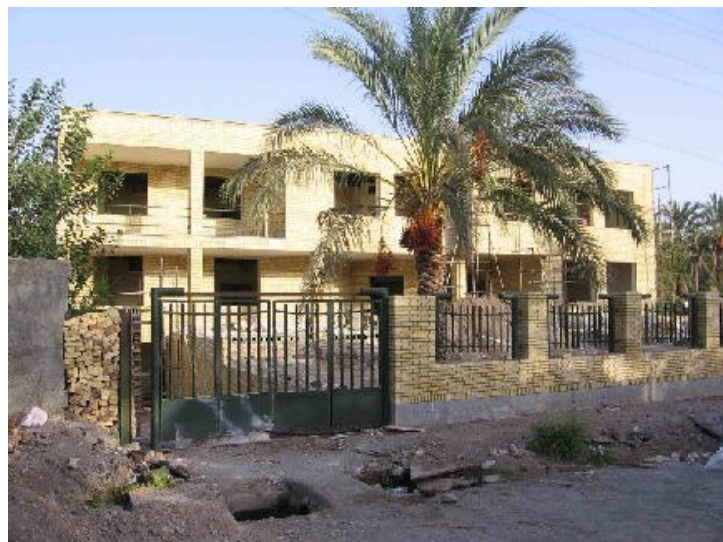
Marefat is one of the special schools which is progressing well and expected to be completed in September, to be ready for the new Iranian school year

The construction of the five standard schools is expected to be completed by 15 September 2006, so that they can be handed over to the Ministry of Education before 24 September 2006, when the new Iranian school year begins.