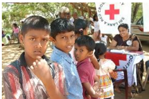
Children at the Sri Lanka Red Cross counseling centre in Nambantota where they are getting much needed psychosocial support.

Objective 5 (psychosocial support): The resilience of the affected population and the local relief workers is enhanced through psychosocial support.