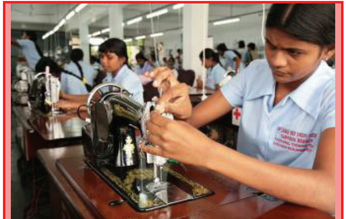
Students learn the art of sewing at the Gampaha Vocational Training Centre.

Since 2007, RCRC partners have adopted a common approach towards working with newly resettled housing beneficiaries. Many tsunami affected families, are being re-housed in sites that can be up to 15 km from their original homes. In this context RCRC livelihoods projects aim to build social cohesion and positive integration between the new communities and the surrounding host community to address the inequities created by the tsunami response.