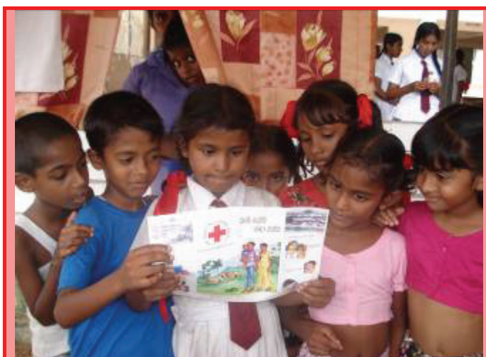
Children learning about self care as part of the PSP programme in the Southern Districts of Sri Lanka.

Through its extensive volunteer base the SLRCS is well placed to respond to priority health needs and carry out community education. RCRC efforts are focused on strengthening health systems that address the needs of vulnerable and poor communities across the 26 districts of Sri Lanka. Projects are being implemented in a sustainable approach that is complimentary to government efforts.