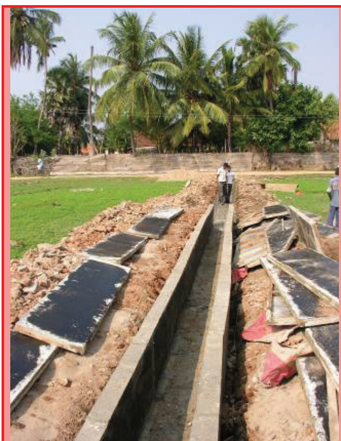
A drainage ditch under construction near Pottuvil in Ampara district. This project will improve sanitation in the area and is being implemented by the local Community Development Council with a grant provided by the CRRP.

Under the Community Recovery and Reconstruction Partnership (CRRP), a mechanism established by the RCRC to channel funding and technical support to people rebuilding their homes, 5,234 families have constructed toilets with the individual water and sanitation grant available to each family. An additional community development grant of LKR 20,000 (USD 200) per household is also available through the CRRP. These funds are spent on the development of community infrastructure. The community determines the priorities