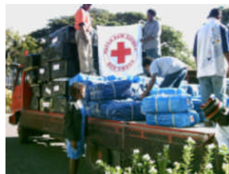
Photo 2: PNGRCS volunteers load a truck bound for affected villages in Langila with relief items.

The PNGRCS and the Federation delegation have been maintaining close contact with the provincial and district branches in the related volcanic areas, instructing branches to mobilize its members and volunteers for the emergency operation. In the past weeks, the PNGRCS and Federation delegation have held coordination meetings to assist operational activities of the national society's national headquarters. The delegation has also deployed a field delegate to assist the national society in implementing the Manam and Langila emergency operation.