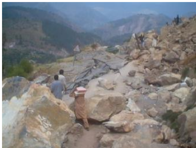
Many remote mountainous villages remain inaccessible with roads destroyed by the earthquake

The emergency operation continues to be complex and challenging. Shelter continues to be a priority, largely due to the scale of the disaster and the imminent onset of winter. About 40 percent or more of the affected people are in remote villages high in the mountains. In some cases, even those in the valleys are inaccessible with major roads impassable due to intermittent landslides. Due to the nature of the terrain and with weeks left before cold weather sets in, distribution of winterized tents and blankets to remote mountain areas remains a priority and a huge challenge. The Federation is regarded as one of the key players among humanitarian agencies in Pakistan.