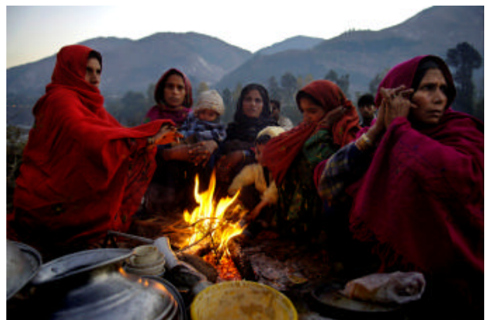
The onset on harsh winter weather in remote mountain villages has put a huge demand on shelter and blankets

One month after the massive earthquake hit Pakistan, difficult terrain and adverse weather conditions coupled with logistical problems are complicating access to some 20,000 quake-hit villagers. Relief agencies struggle against dwindling budgets and blocked roads to deliver aid to remote mountain locations. Latest assessments put the death toll at 86,000 and about 100,000 people have been reported injured. On 6 November, a 6.0 magnitude aftershock jolted many northern areas unleashing new landslides throughout the Kagan valley and injuring seven people in Batagram, one seriously.