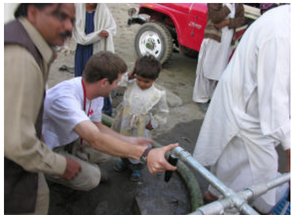
Federation ERUs are providing water to nearly 50 percent of the population in Balakot and the surrounding areas

The Federation's water and sanitation emergency response units (ERUs) continue to be operational in Balakot and Batagram and to provide support to Pakistan Red Crescent and other Red Cross Red Crescent partners in hospitals and clinics in Abbottabad and other areas. The Federation is sending two additional staff to support the ERUs to develop their activities in relation to sanitation and hygiene, as this is seen to be an important priority in the immediate future.