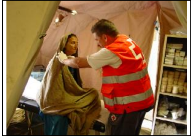
The Spanish basic health care ERU in Balakot has treated over 2,000 patients since operations started.

In Batagram, the French health ERU has to date treated over 3,600 patients and has run remote clinics in Bateela and Rashang. A semi-permanent hospital now under construction in front of the ERU is a cause for concern, with water run-off and muddy conditions likely to affect clinic facilities over winter. At this stage it is difficult to say what impact the hospital will have on the ERU's work. While the team has some local staff, an ongoing challenge has been to get the local authorities on board. A German Red Cross doctor has joined the ERU for a short period and is able to provide medical advice when the regular doctor is in the field. The number of cases related to the earthquake is decreasing with a shift in needs towards primary health care.