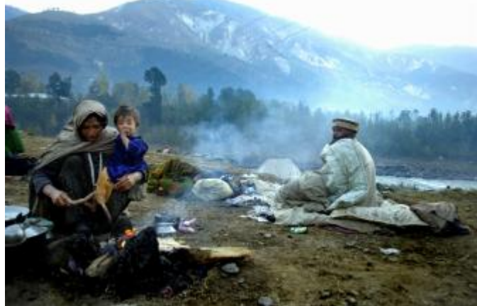
As winter approaches, the Federation is distributing tarpaulins and shelter repair kits to quake-affected people in highland areas

Meanwhile, the process of relocating over 12,000 quake-affected people accommodated in tented villages in Islamabad has started with the return of 1,000 displaced people to their hometowns. The government has launched a nation-wide volunteer drive to hire 1,500 volunteers to help earthquake victims rebuild houses, ahead of the international donors' conference on 19 November. This conference called by the government of Pakistan aimed at filling funding shortfalls and looking ahead to the recovery phase.