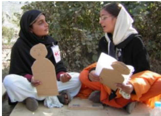
Local women have been trained by the Federation to carry out hygiene promotion in villages and camps around Balakot.

The latrine construction programme is progressing, albeit with difficulties. Unsuitable ground conditions (groundwater level often too close to the surface and rocky or sandy soil) and expensive building materials have caused delays in construction. As a result, only 20 latrines have been properly completed so far. The superstructure for 50 latrines is ready and a second contractor has started to construct 20 additional latrines.