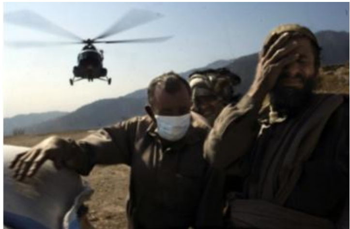
Bad weather has hampered helicopter operations delivering shelter and relief items to remote and isolated communities in northern Pakistan.

According to the United Nations, the onset of winter has already claimed the lives of at least three earthquake survivors. More than 100 others in the northwest of the country have been taken to mobile clinics and hospitals suffering from hypothermia and respiratory diseases. International relief agencies have warned that the harsh Himalayan winter could lead to more deaths in the worst-hit districts of Muzaffarabad, Neelum Valley, Bagh and Rawalakot. Bringing shelter materials and mobile health teams to high altitude areas is critical.