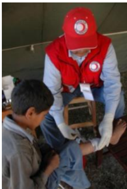
An injured child receives treatment at the PRCS medical facility in Chakoti.

Since operations began last month, the Federation, and its Red Cross and Red Crescent partners have treated more than 48,500 patients in northern areas of Pakistan.