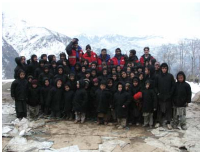
Children, who are among the target beneficiaries of the Federation operations, crowd around to pose with PRCS volunteers.

Items like sewing machines, wool and knitting pins, kits with indoor and outdoor toys for children at different age groups, sports equipment, craft items and tools for different vocational training activities, have been purchased and delivered to different camps. Incentives for volunteers, such as hats, shawls, bags and torches, have been bought and will be delivered in the coming weeks with programme logos attached. Special “well-being” kits with underwear, shawls, washing powder, hair shampoo, body lotion, hair brush, combs, hair clips, mirrors etc. have been ordered and will be distributed broadly to beneficiaries to complement the ordinary hygiene kits. Possibilities of organizing a big distribution of shoes, fleece jackets, recovery kits and other useful items with the tools to support the rehabilitation phase in the communities have been discussed with the regional representative of the Danish Red Cross.