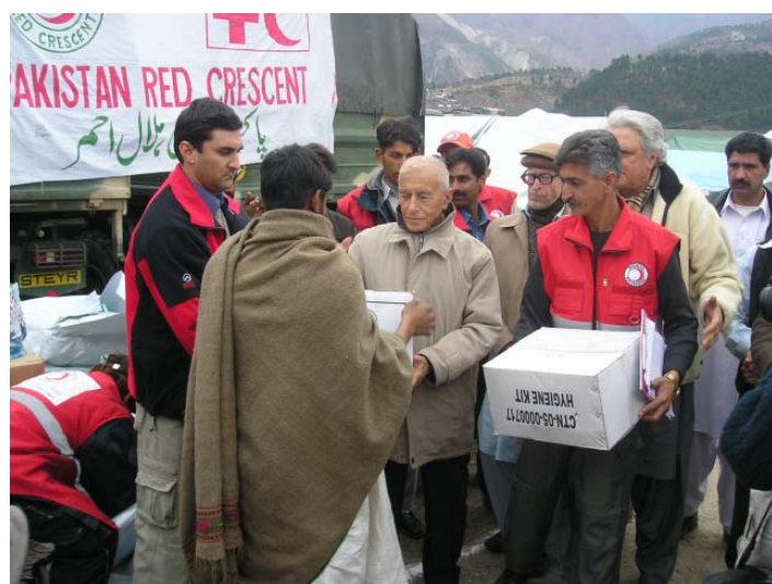
Relief distributions like this one help families survive the difficult times that follow a disaster.

The Norwegian Red Cross all-terrain vehicles and belt wagons have begun carrying relief items, including the CGI packages, to high-lying, remote mountain communities in Satbani and Balakot sub district. So far, the team, comprising 16 vehicles and a corresponding number of Norwegian rescue team members/drivers, has been able to provide relief items to 80 families daily using the Balakot Rubb Hall as a base for loading. Unfortunately the work of the Norwegian Red Cross volunteers has also been affected by the recent security situation, but the remaining team is continuing to assist with planned distributions.