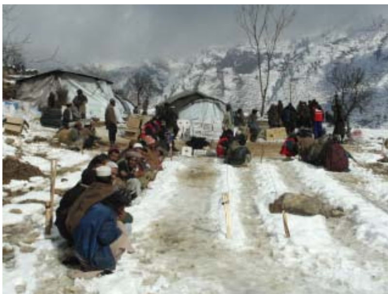
Distribution of non-food items in Allai Valley.

The reporting period has seen some major challenges to the ongoing relief operation. Although the winter weather in Pakistan has been in general warm for the time of year, there have been a number of landslides and avalanches, which have blocked the distributions. In addition, recent religious celebrations and heightened security awareness, relating to the protests against the publication of cartoons in the European media, has limited delegates' movement and the level of relief distributions.