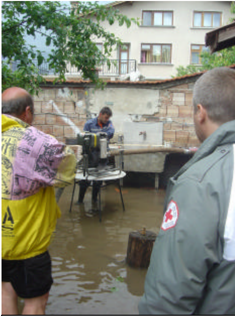
Affected community in Novi Iskar