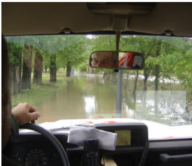
Flood waters in the region of Novi Iskar