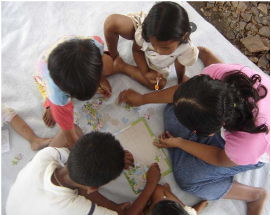
Photo above: Children playing with jigsaw puzzle – part of the PSP activities

PSP activities are reported to PMI weekly, and will be translated from Indonesian to English at the Federation delegation in future. UNICEF, through its protection program, has been active in supporting the coordination of the PSP activities in the earthquake affected areas and their mapping has been shared with PMI and the Turkish Red Crescent. Data on the Movement’s activities was not included but will be compiled for submission and reported on in the next operations update. Gaps in support were noted in a number of areas and this will be considered by the PMI and partners.