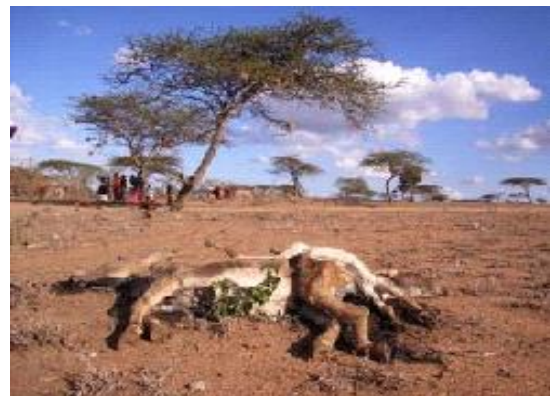
Photo right: Overwhelmed by thirst and hunger, this cow died while giving birth.

A recent Kenya Food Security Meeting (KFSM) report indicates that the most critical delay in rainfall was experienced in the eastern and northern parts of the country. The short rains crop prospects were favourable in the highland areas of Nyanza and Western provinces but poor in Central, Eastern and Coast provinces. The regenerative capacity of the perennial grasses has been lost, and the little pasture and vegetation that has been left will deplete rapidly, as the drought conditions accentuate. Most of the ground is therefore bare and thousands of cattle are dying daily.