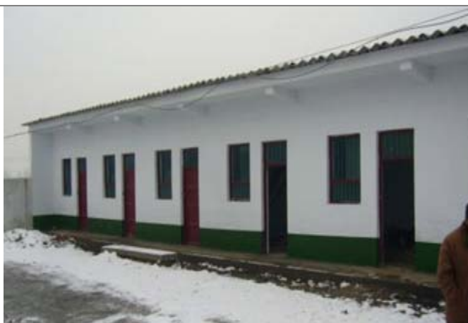
A collective house block of five in Shuanglou Village in Henan province is nearly ready for the families to move in.

Summary: Red Cross relief efforts after devastating floods hit China this summer are progressing on schedule. Reconstruction of housing is underway in Hubei and Henan provinces for 330 families who completely lost their homes with 150 and 180 houses to be built in each province, respectively. A report from Henan province said that some houses were nearly completed. Chongqing Municipal was a third candidate for the reconstruction of 70 houses. However, this assistance was canceled after the Red Cross Society of China (RCSC) and the Federation visited the sites and made an assessment based on needs of the population and priorities of the RCSC based on current funding.