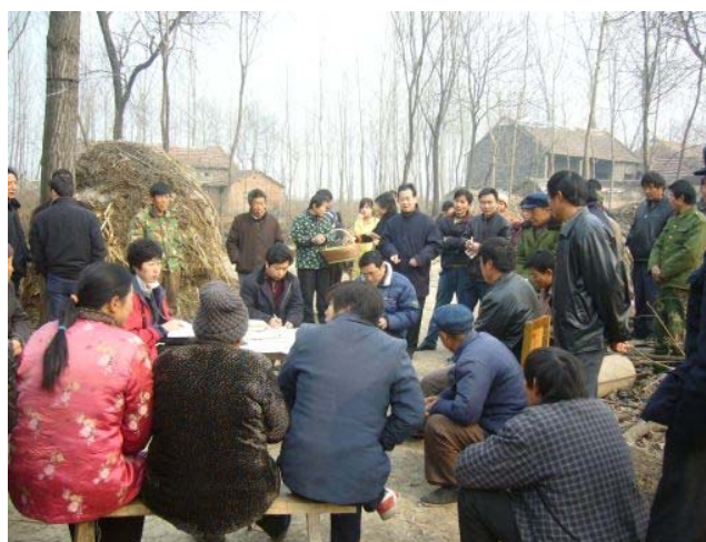
Villagers in Zhengyang County, Henan brainstorming on how to reduce the impact of floods.

Challenges: Key factors in the success of community-based projects are for the national society's staff to lead the community to be active to implement a project themselves. People in China are used to top-down policies, as are many Red Cross staff members. A truly community led project is expected to bring challenges for both Red Cross implementers and villagers alike. But, successes from past community-based projects have provided the RCSC many examples of best practice and fruitful experiences that can be shared with the local Red Cross and villagers involved. Funding in this area of the appeal is low, and thus it is regretful that these very important activities cannot be carried out in all beneficiary communities.