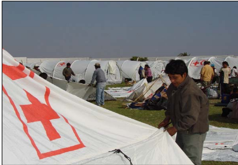
Distributed tents have been set up in a number of locations with the participation of families.