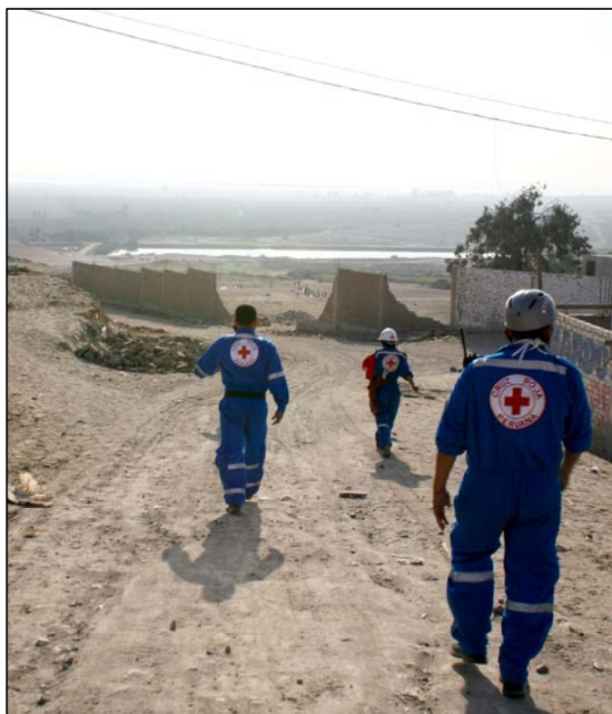
Peruvian Red Cross volunteers distribute supplies, including hygiene kits from the American Red Cross to the town of Caucato, Peru. This town was almost completely destroyed.

Direct support has been provided to filtering fundraising opportunities and relationship management. In the following weeks, the participatory process of establishing a plan of action for the operation represents an excellent opportunity to reinforce the main role of the PRC for the ongoing activities in coming phases. In particular, the early recovery assessment and plan will represent an opportunity to integrate new specialists into the NS staff, which contributes to the programme focus (from relief to risk reduction).