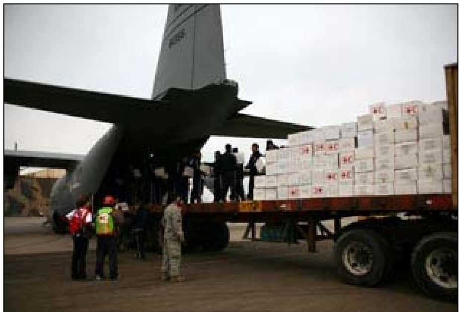
Relief goods are unloaded after arriving on a flight from PADRU.

To date, eight plane loads of humanitarian assistance with blankets, tents, jerry cans, plastic sheeting, hygiene kits, kitchen sets, water tanks and water purification tablets have reached Lima for transport to the quake zone via air-bridge and truck. These include three planes chartered by the Pan American Disaster Response Unit (PADRU) in Panama, two planes chartered by the Spanish Red Cross, one plane chartered by the Belgian Red Cross and supported by the Belgian Government. The Netherlands Red Cross, in collaboration with the Colombian Red Cross and with the support of the Colombian Armed Forces has sent approximately 72 tonnes of relief through airplanes of the Colombian Armed Forces. More flights are expected to be sent carrying relief items. The Swiss Red Cross has been sending assistance through the facility recently granted by KLM (free cargo space for the Red Cross operation), and the Spanish Red Cross plans to do the same.