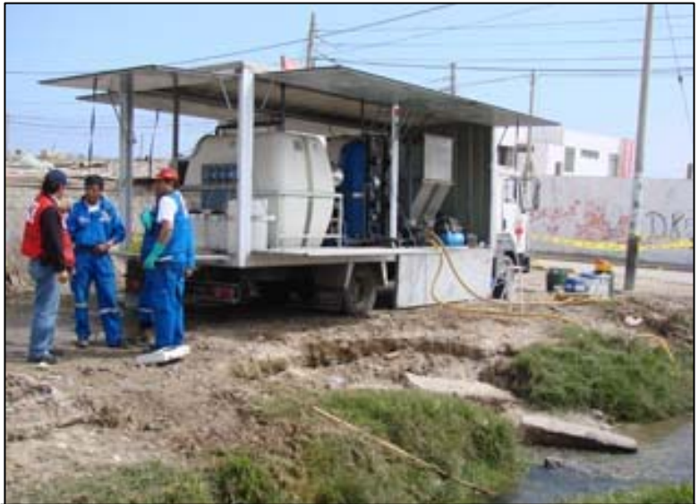
PRC's water treatment plant in Pisco.

A community that has an operational water source was identified in the Montesierpe sector 32 kilometers from Pisco to initiate the process of purifying the water. There are plans to produce 40m 3 of water daily to supply this and the neighbouring communities; coordination with the municipal authorities will be undertaken to achieve this.