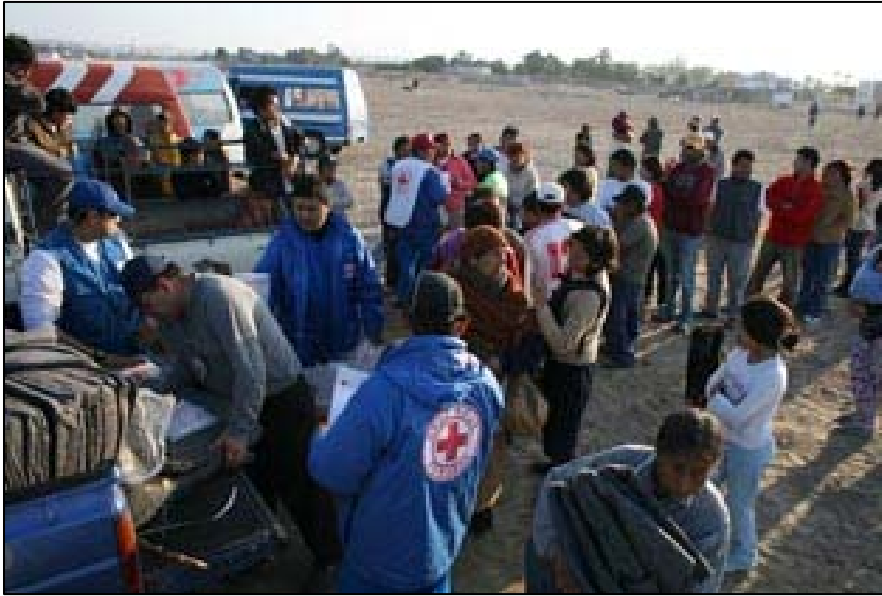
Registered families line up to receive blankets from PRC volunteers.

The PRC have carried out distributions as follows: