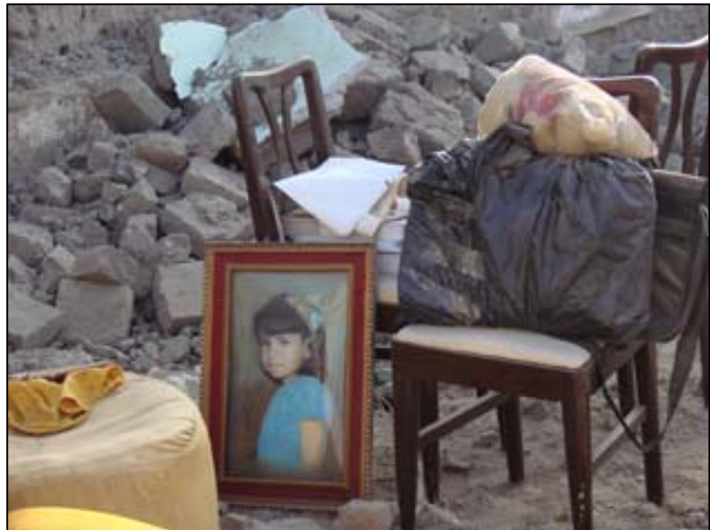
A family's property remains on the street after the earthquake.

While water supply is gradually being restored to affected areas, most families in Pisco still rely on water provided through water tanks. Bladder tanks are needed to store water in key places and provide ongoing supply to the communities until water supply is fully restored. SEDAPAL (Lima Water Corporation) specialists and others are working to restore water services and SUNASS (National Sanitation Authority) warns that more water tanks and electric equipment are needed to improve water supply. Most people do not have proper water jerry cans and use unsealable buckets, which increase the risks of contamination of the water.