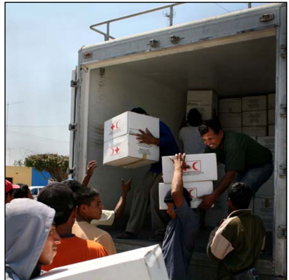
Distribution of Red Cross hygiene kits and blankets to La Independencia

Immediate needs remain tents, dry latrines, shelter materials (wood, plastic sheeting), blankets, jerry cans, hygiene kits.