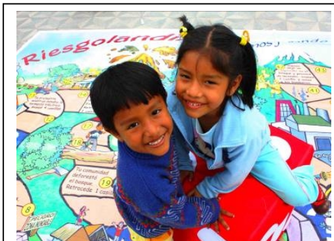
On 23 October the American Red Cross and the BRC-Fr led a risk awareness promotion fair in Chincha. The International Federation game Riskland was enjoyed by children.