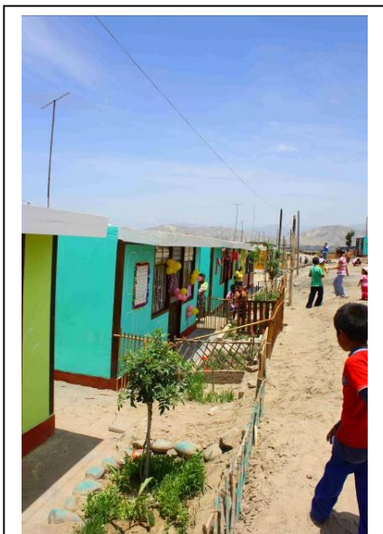
Healthier communities where children can play are the outcome of the comprehensive reconstruction participatory programme.

The PPR outcomes indicated that the communities greatly appreciate the support of International Federation for developing a healthy environment and living practices that promote people's welfare. The communities are thus receiving tools and training for developing collective and individual healthy practices.