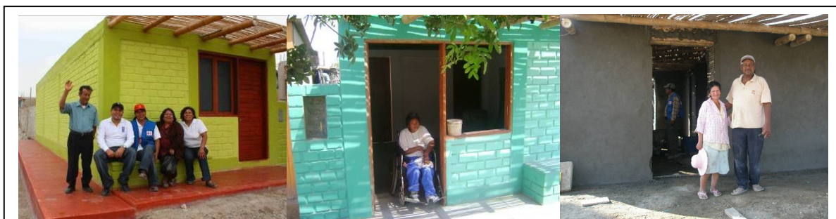
The participation of the community in the identification of beneficiaries and in the construction process has allowed the International Federation to assist the most vulnerable population: single parents, people living with disabilities and the elderly.

The International Federation's participatory rehabilitation programme builds safe and secure houses for the most vulnerable families in the target areas. The programme uses traditional construction techniques improved by the expertise of universities and research centres such as PUCP and PREDES. The construction materials and designs are seismic resistant, eco-friendly, and affordable to the population. The communities have received logistic and technical support from the programme for the building process. More importantly, they received training in the promoted building techniques. The participatory nature of the programme contributes to the sense of ownership and to a domino effect that ensures increased numbers of people gaining the knowledge and skills for construction with the following techniques (details can be found in the previous operation updates):