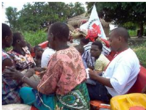
Red Cross Volunteers assisting by moving families affected by floods to safer areas and relocation centres in Mozambique.

The National Red Cross Societies of Botswana, Lesotho, Malawi, Mozambique, Namibia, Swaziland, Zambia are requesting for international assistance through the International Federation of Red Cross to continue with relief assistance to families affected by floods and storms caused by heavy rains since beginning of December 2007. Localised and heavy flooding in Mozambique, Zambia and Zimbabwe destroyed houses, infrastructure, crops and livestock, whilst the situation is worsening in Botswana, Malawi's southern districts and in Namibia's Caprivi region in the north. Zambia's flood zones are also expanding in the Western, North-Western, Eastern and in Lusaka provinces. Destructive storms with heavy rains were experienced Lesotho and Swaziland in early January. It is estimated that a total of 66,830 families have been affected, southern Africa and are in need of relief assistance in the form of shelter, food, clean water and sanitation.