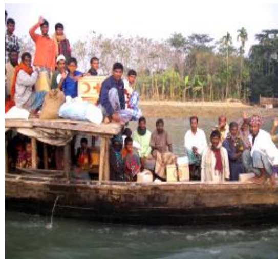
Beneficiaries returning home by a waterway after receiving relief material from the BDRCS/Federation

According to a recent press release by the Bangladesh Cyclone SIDR Shelter Coordination Group, approximately one million people remain in need of basic shelter assistance in the coming winter and rainy seasons. In many districts more than half of the thatched-roof homes, primarily inhabited by the extremely poor, are completely destroyed. A high proportion of wood-framed houses with corrugated iron roofs have been destroyed or severely damaged in coastal areas. Implementation of a community-based cyclone resistant