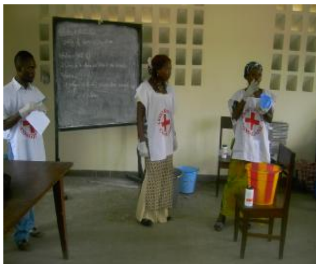
Congolese Red Cross volunteers are getting set for sensitization

<click here for the DREF budget, here for contact details>