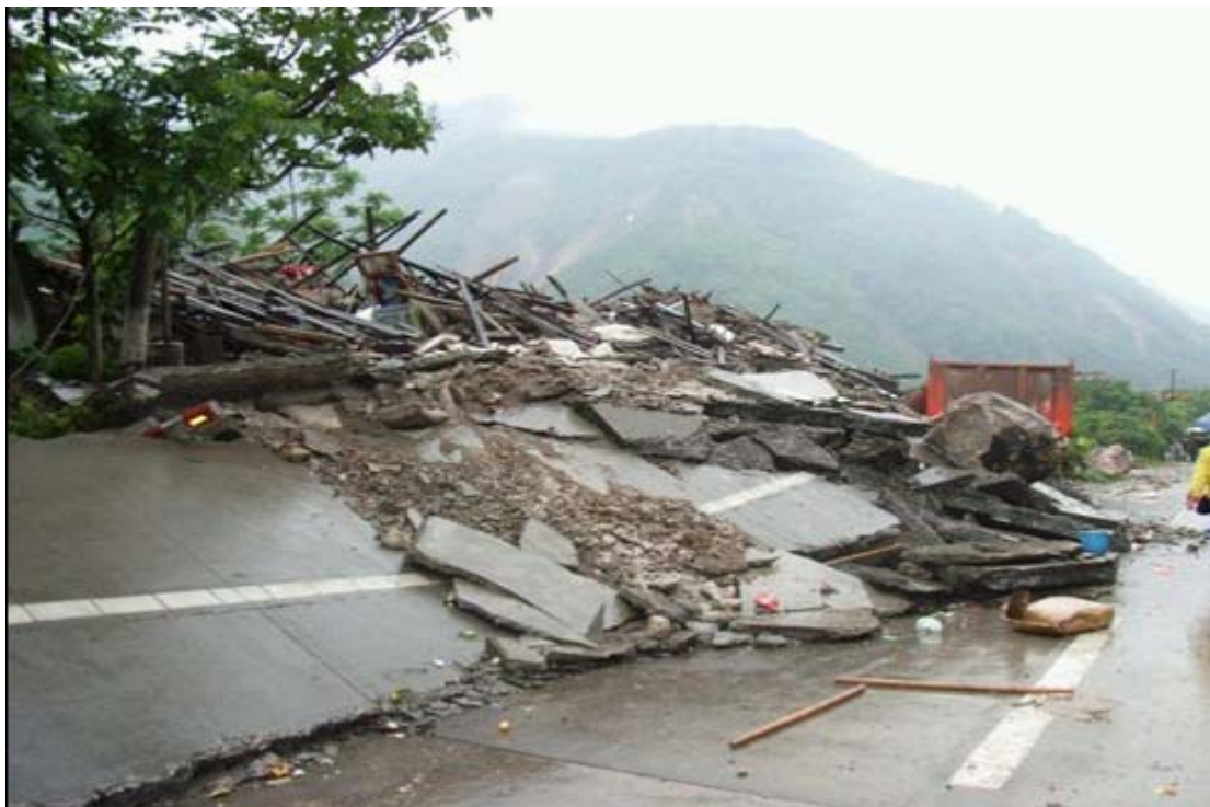
Damaged roads in Wenchuan County have disrupted transportation routes. (Red Cross Society of China)

There are more than 26,000 injured survivors in Sichuan province, and medical supplies are urgently required. Many hospitals and clinics have collapsed and medical professionals have been treating patients in the streets or in tents with whatever supplies they have available.