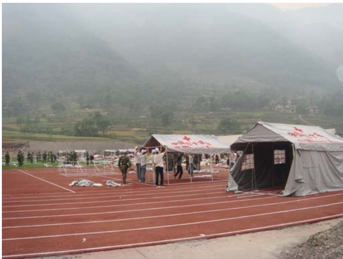
RCSC volunteers setting up tents for survivors

The RCSC is working on a detailed plan of action. Through this appeal, funding will be provided for the initial relief phase, in addition to funding mobilized by the RCSC. This appeal will cover the provision of relief supplies for approximately 100,000 beneficiaries most in need and include the following: