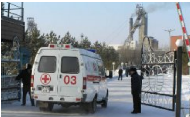
A mine blast in the Karaganda region of Kazakhstan has taken the lives of 30 people.

Summary: A mine blast in the Karaganda region of Kazakhstan on 11 January 2008 killed 30 people, leaving a further 18 injured. The miners injured in the accident, their families and the families that lost members are in shock and showing signs of stress that require psychosocial assistance and counseling. The National Society will organize immediate support and longer-term recovery for the 191 affected families.