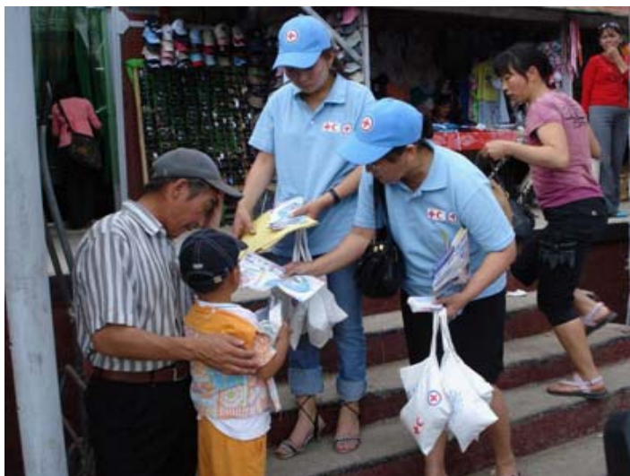
Children and their parents receive hygiene promotion materials from the MRCS Red Cross volunteers to help prevent the spread of hand, foot and mouth disease. MRCS

Concurrent to this major outbreak, many of the affected provinces are coping with the devastating consequences of the snow fall disaster that struck most of Mongolia in early May in which 52 people died and 150,000 livestock animals perished. It was estimated that 1,500 people were affected in that disaster and now face risk of encountering HFMD shortly thereafter.