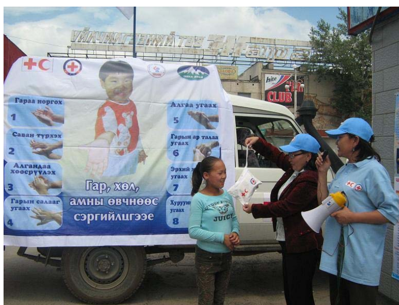
Mongolian Red Cross volunteers target youth and their parents in hygiene promotion activities in Ulaan Bataar.

Hygiene promotion activities have commenced and already volunteers and staff of the Mongolian Red Cross Society have been mobilized to deliver important messages to the public about the prevention of this disease. Activities to support capacity building at the branches for the ongoing prevention of hand, foot and mouth disease will start in late July.