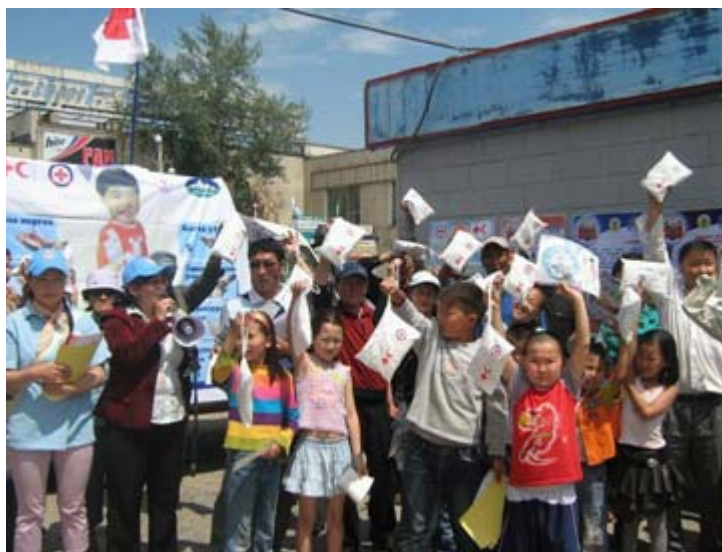
Children in Ulaan Bataar show that they have received hygiene promotion materials on hand, foot and mouth disease from the MRCS. MRCS

The MRCS has been actively monitoring the development of the epidemic and exchanging information with relevant government agencies, the national emergency management agency and the ministry of health. The office of UNICEF in Mongolia has produced radio spots on hand washing and has broadcast public service announcements on national television channels. Supported by the ministry of health, UNICEF Mongolia has developed and disseminated technical guidelines for health facilities in affected areas and has conducted trainings of primary health care doctors on diagnostics and clinical management of HFMD. The statistics relevant to HFMD cases in Mongolia have been received from the ministry of health and the national infectious diseases study center, and the key messages the MRCS has used in the public education materials were provided by the above organizations.