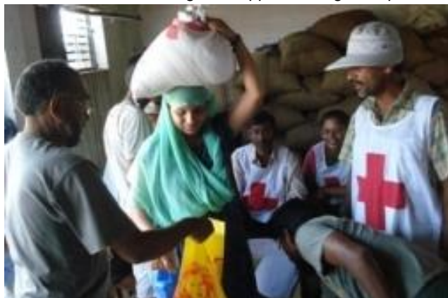
A woman beneficiary receives relief material from NRCS volunteers