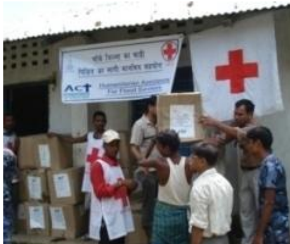
NRCS volunteers distributing relief material to flood affected families