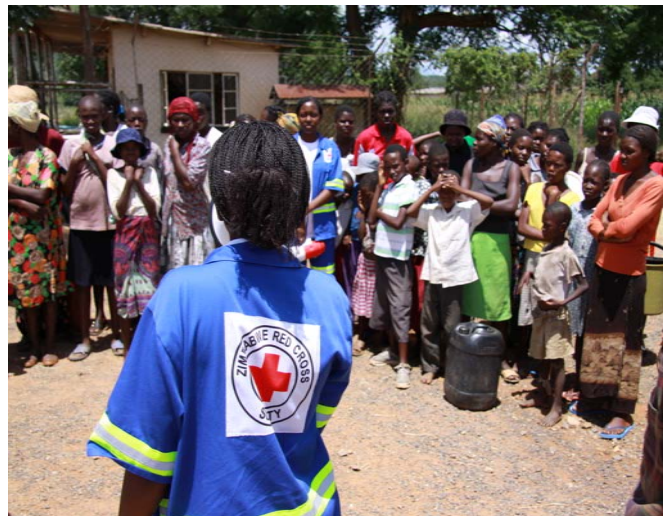
Zimbabwe Red Cross volunteer during hygiene promotion.

Summary: The past few weeks have seen an increase in the number of cases reported in rural areas, whilst urban cases have declined. The epidemic can now clearly be characterized as predominantly rural, a reality that brings with it unique and complex operational challenges. By 17 February 2009, cumulative cases and deaths stood at 78,882 and 3,712 respectively. Interestingly, the case fatality rate has dropped below five per cent for the first time since early December and stands at 4.7 per cent, indicating increased impact on behalf of humanitarian organizations and public health authorities. However, the proportion of deaths reported in the community has risen from 60.1 per cent on 3 February to 61.3 per cent 1 , showing that many of those affected remain unable to access treatment and support even in districts where it exists.