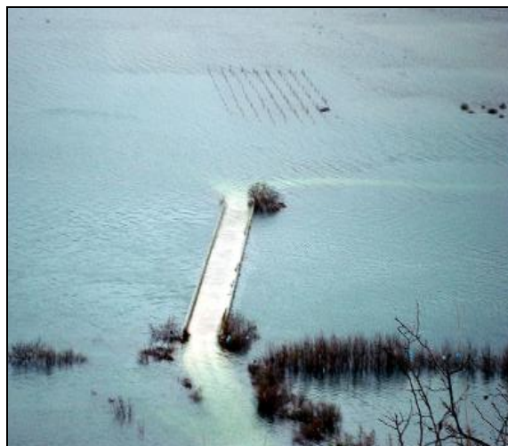
Photo 1: Flooded landscape in Popovo Polje.

Heavy rainfall in the second half of January and early February caused flooding in the southern parts of Bosnia and Herzegovina. Food reserves were destroyed and water sources contaminated, and vast areas of cultivated land were flooded. The Red Cross Society of Bosnia and Herzegovina supported the affected population with food and non-food items in order to overcome the most urgent needs.