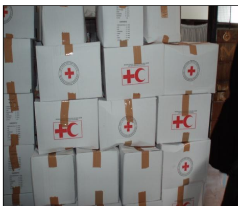
Photo 3: Procured food parcels. Red Cross Society of Bosnia and Herzegovina.

Activities planned: Procure and distribute food parcels through volunteers to identified beneficiaries according to Federation standards. Monitor, evaluate and report on implemented activities.