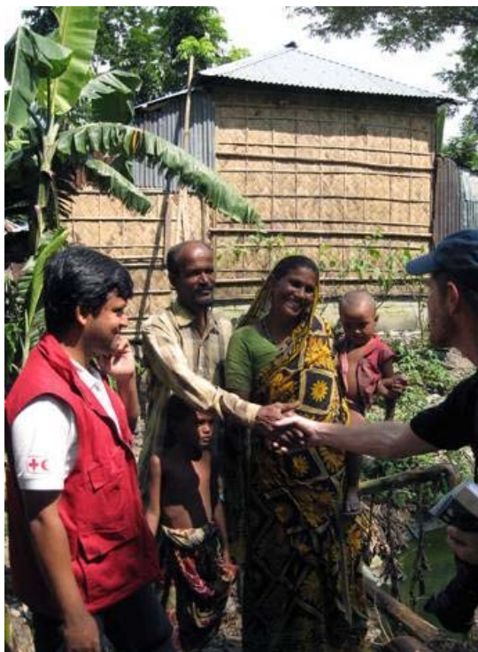
BDRCS has provided core shelters to cyclone affected families under the Sidr operation.

The water and sanitation programme has provided latrine construction training and over 5,100 sets of construction materials to the beneficiary households. Up to 17 new boreholes and three new pond sand filters (PSF) have been installed to provide safe and sustainable water sources to the affected communities. In addition, based on the needs assessment outcomes, repair work and cleaning of existing water sources were carried out. An evaluation of the hygiene promotion and the participatory hygiene and sanitation transformation (PHAST) component was completed during the reporting period, and has revealed that the number of cases of water-borne diseases in the target communities has declined.