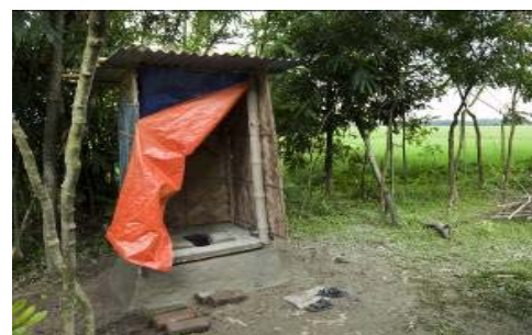
A pit latrine in Durgapur village, Pirojpur constructed with the help from BDRCS

The Sidr programme planned to supply latrine construction materials to 7,300 households in the targeted areas. To date over 5,100 sets of materials have been delivered to households and the rest is in progress. The beneficiaries themselves construct the latrines upon receipt of required materials and after attending latrine construction training. The construction of latrines by beneficiaries is being monitored continually by BDRCS to ensure good quality and that the latrines are constructed above flood levels to avoid contamination. Use of latrines is being monitored through the community volunteers trained as part of the hygiene promotion programme.