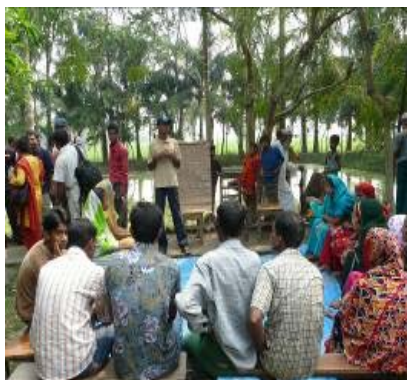
A volunteer conducting CBPSP training

Expected result: Psychosocial support is accessible to the most vulnerable as well as BDRCS staff and volunteers.