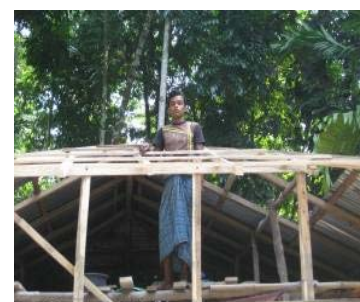
Repair work in progress