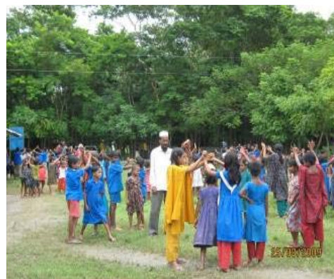
Children under the PSP programme designed to increase their resilience to future disasters

Public health in emergency (PHiE) training is the main activity for the Sidr recovery health programme. A total of 12 PHiE training sessions were planned and organized, covering 48 communities and cyclone preparedness programme (CPP) volunteers which includes around 30 BDRCS cyclone shelters. A total of 263 people have been trained by the programme. In addition, ten experience-sharing workshops were held. The programme has been effective in disseminating health messages and basic skills to communities. Trained volunteers and community people have started applying their knowledge and skills to help peers in their communities. First aid kits have been distributed to trained volunteers who will provide first aid in their communities when needed. As opposed to the common belief that community people are mainly interested in hardware and more tangible support, communities have found the PHiE programme useful and have even called for the continuity of such programme beyond the Sidr operation.