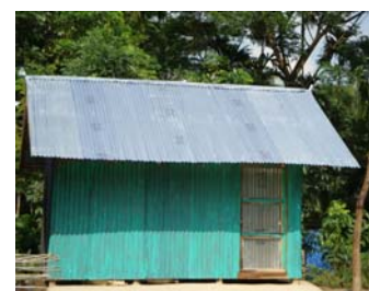
Repaired house. Roof with new CGI sheets

The monitoring of repair works by beneficiaries will continue throughout December 2009.