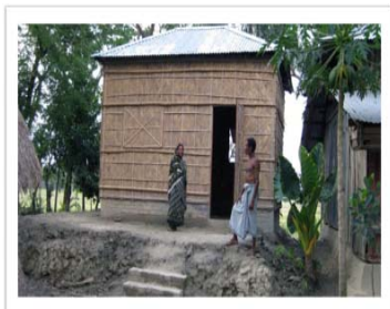
The Sidr operation provided core shelters to 1,250 beneficiary households.

Objective 1: 1,250 of the most vulnerable cyclone-affected families in the Barguna, Pirojpur, Bagerhat and Patuakhali districts are living in a safe and healthy environment within 18 months of the beginning of the project. Expected result: Identified vulnerable families are living in safe, healthy and culturally acceptable shelters. Beneficiaries qualify for a core shelter, tools, training, cash grant and technical support.