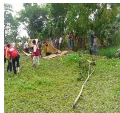
Cyclone simulation exercise where BDRCS volunteers learnt about relief work.

A cyclone warning simulation exercise was organized in Barguna in October in order to create awareness in the communities about the importance of early warning messages.