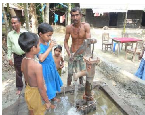
Children drinking from a newly installed deep tube well. About 100 households in the community fetch drinking water from this tube well.

In order to ensure a safe and sustainable water source in each targeted village, the Sidr operation carried out village-to-village needs assessment. Based on the results of the assessments, repair work of existing water sources as well as the installation of new water points were planned. To date, 17 new deep boreholes and three PSF (pond sand filters) have been constructed. Repair of over 100 tube wells and hand pumps are in progress and will be completed by the end of the month or early December.