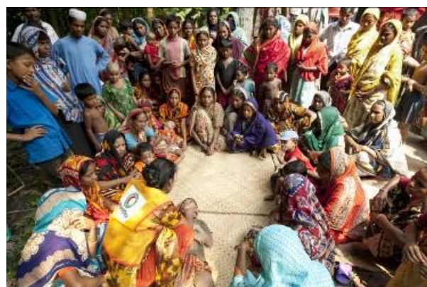
A PHiE trained volunteer showing people how to provide first aid.