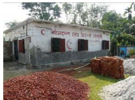
Renovation work in progress in BDRCS' Pirojpur branch.

Renovation works in Pirojpur and Patuakhali are ongoing at the moment, and renovation work will begin on two other buildings in Barguna and Bagerhat. A small warehouse will be accommodated within these two buildings in order to enable the branches to keep some relief stocks. Due to the delays in finalizing the contractors, the renovation is expected to be completed in December.